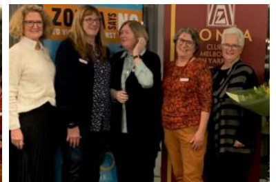
Welcome to new Board Members