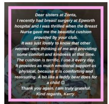
Feedback from recipient of Breast Care Cushion

Zonta Club of Melbourne on Yarra would like to thank the following for their support: