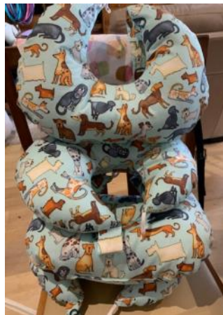
Table: Number of cushions delivered in the past 18 months