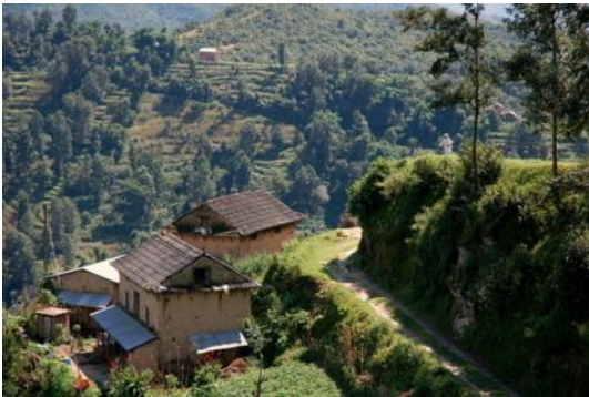
Typical Nepalese house in a remote village