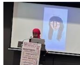
March Awards Night