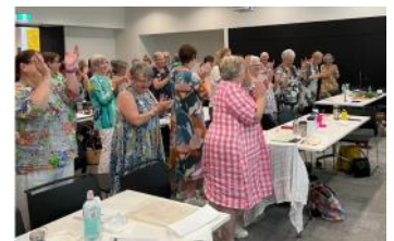
Areas 1 & 4 Conference