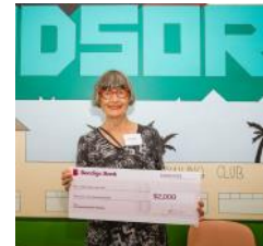
Grants from Bendigo Windsor Community Bank